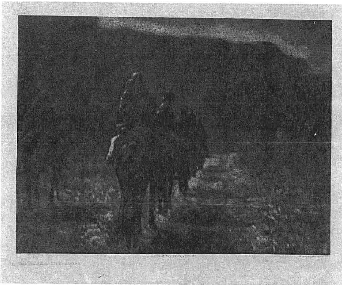
"The Vanishing Race" (Navajo, 1904) - on horseback, a group of Native Americans in silhouette, slowly ride into an uncertain darkness - an uncertain future. Using motives and rhythms of Indian memorial songs commemorating the dead, the music is alternatively noble, sad, tragic, angry and accepting.