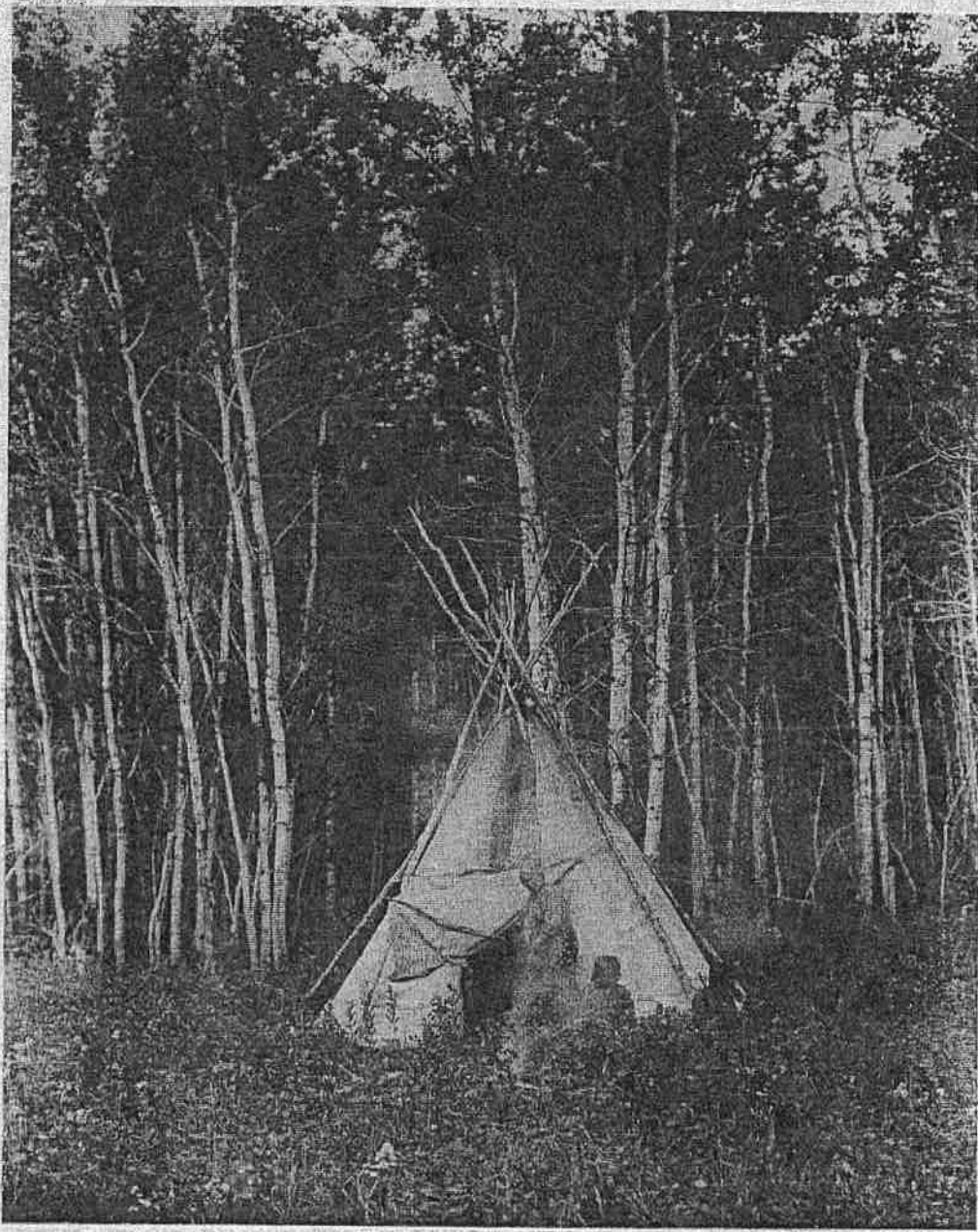
A CHIPPWEVA TEEPEE AMONG THE ASPENS

“Among the Aspens” (Chippewa, 1926) - portrait of a teepee in the midst of a thick grove of Aspen trees. An introduction, consisting of traditional Indian drum beats and pentatonic melodies leads to a scherzo portraying the rushing waters of the innumerable streams and rivers of the Chippewa nation.