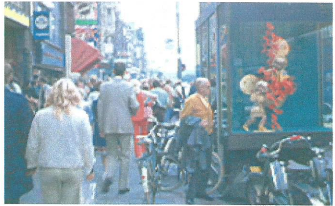
Dad, in the yellow sweater, looking at a window display from a busy Amsterdam sidewalk.

Just as it was when we left O'Hare, it was raining when we landed in Amsterdam. After clearing customs, finding our hotel and getting cleaned up a bit we donned our raincoats and spent the afternoon on an American Express tour of the city.