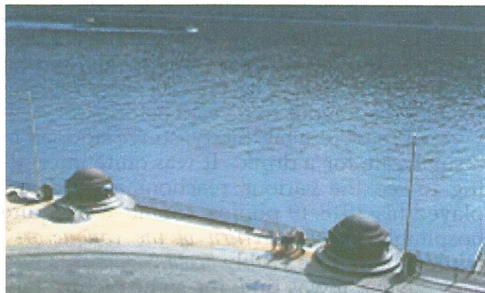
Dad is among that group of people down by the riverside. I imagine he was telling them what things were like in 1919.

We had a good vantage point, from the Fort, to see in three directions. As you may imagine he had a story to tell about each of these points of interest.