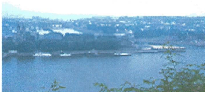
The Mosel River joins the Rhine at the tip of land on the far right, above. Dad remembered a statue of Kaiser Wilhelm on horseback on the flat area to the left of where the rivers meet.

In talking with one of the people down on the point Dad learned that the Kaiser Wilhelm Statue had been destroyed on orders from Hitler in 1939 or 40.