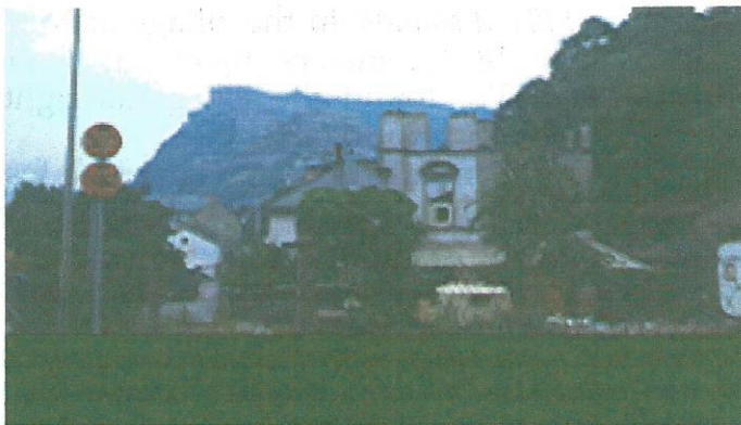
Ehrenbrietstien is the fort on the top of the high bluff.