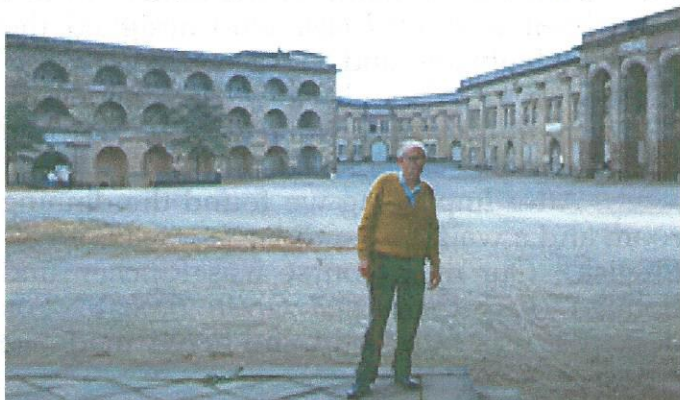
Dad on the Parade Grounds inside the fort.